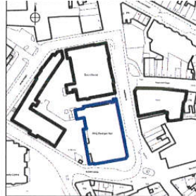
Location Plan Scale 1:2000 @ A3

NOTES: – Do not scale to ascertain dimensions. Any errors or omissions should be reported to the Surveyor before proceeding with work. Figural dimensions and levels should be verified by the contractor on site before construction. Copyright for all designs and drawings in whole or in part shall remain with the Surveyor in accordance with the copyright act. The original measured survey plans were not prepared by Blackbriars with Dames & Moore/Geomatics. These are not construction drawings and cannot be relied upon. The contractor or any third party is responsible for taking their own measurements.